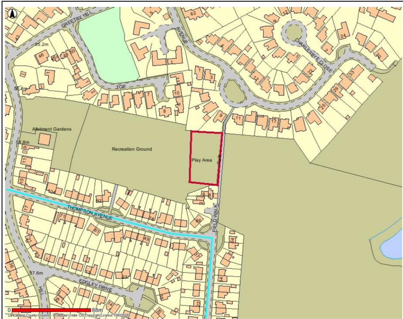
Thompson Avenue Play Area