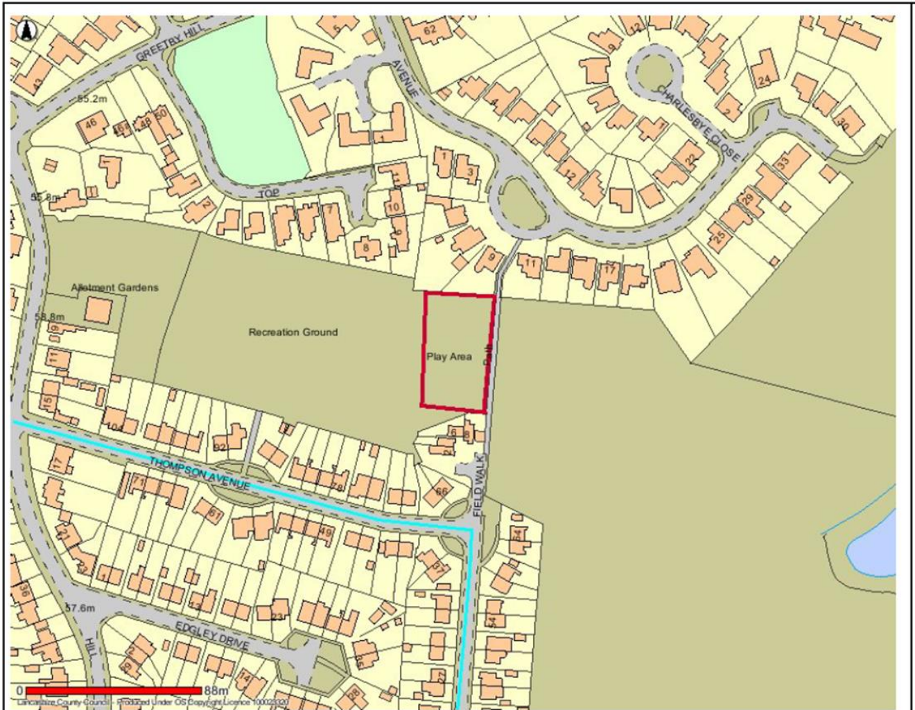
Thompson Avenue Play Area